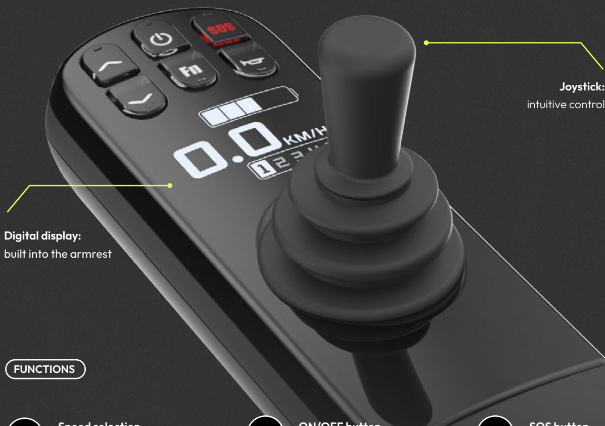
Joystick: intuitive control

The precise calibration ensures a safe riding experience and you remain in control at all times.